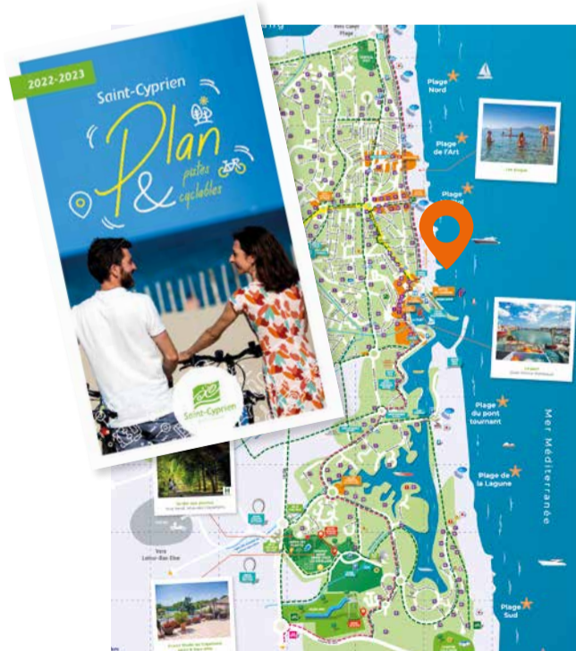
Saint-Cyprien: Map & cycle paths