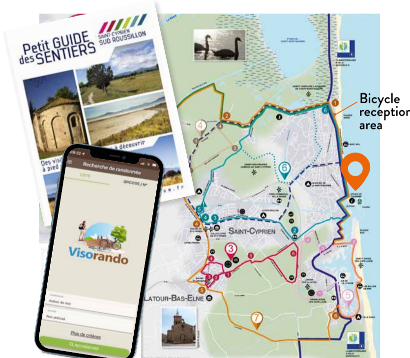
Surrounding municipalities: Short guide to the trails & Visorando